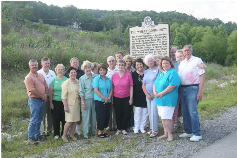
Wheat Alumni Association and Oak Ridge Historical and Preservation Association members gather at the newly-installed Wheat Historical Marker